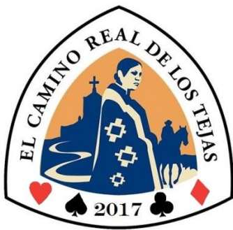
HEART OF TEXAS RALLY

The historic El Camino Real ran from the capitol of New Spain — present day Mexico City — winding through Saltillo, Monterrey, Laredo (on the modern Texas border), San Antonio, and Nacogdoches, before reaching the Louisiana border at the Sabine River and ending at Natchitoches in modern Louisiana. The trail has a 2,500-mile length. For centuries the Native Americans had used the trail routes for trading between the Great Plains and Chihuahuan Desert regions. The El Camino Real de Los Tejas was first followed and marked by Spanish explorers and missionaries in the 1700s. It was one of several named El Camino Real, or 'royal road' or 'King's Road', that connected the